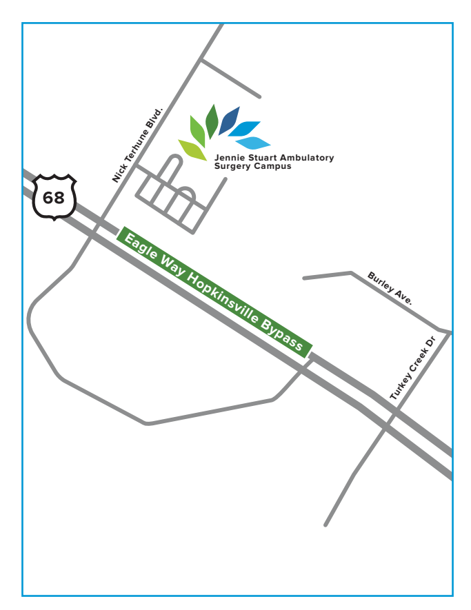
Jennie Stuart Ambulatory Surgery Campus

Wear loose, comfortable clothing that you can change easily and will not bind the site of your surgery.